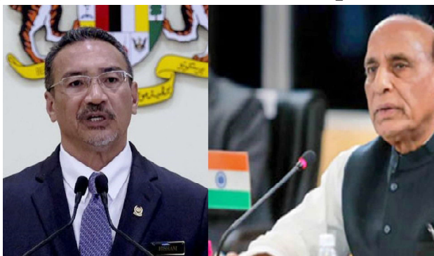
(Left): Senior Defence Minister of Malaysia, YB Dato 'Seri Hishammuddin Tun Hussein, (Right): Defence Minister Rajnath Singh.

The two Ministers discussed the existing defence cooperation activities and framework, and ways to further enhance them under the existing Malaysia-India Defence Cooperation Meeting (MIDCOM) framework. The